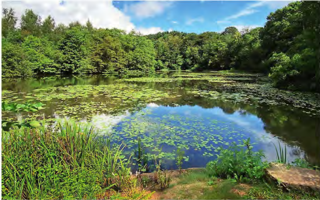
Hammer Wood Pond