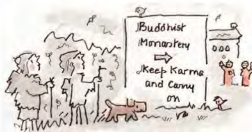
Keep Karma and Carry On in Cumber's Lane

There is good reason the Buddhist masters chose the heavily wooded area around Chithurst for their monastery.