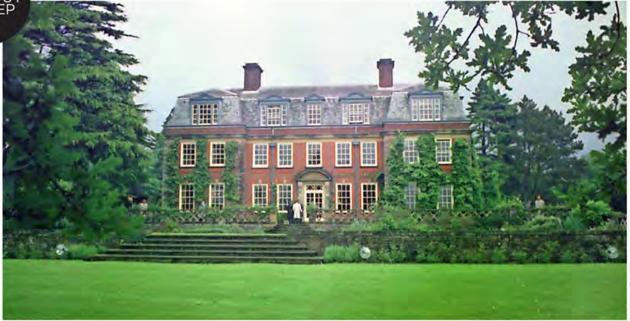
Birch Grove House