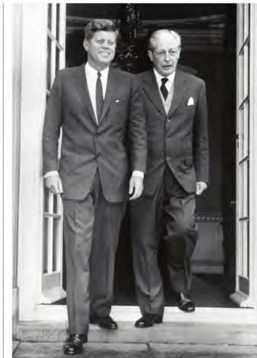
Harold Macmillan (right) and American President John F Kennedy at the Premier's Sussex home

Other prominent political visitors to the house during Macmillan's time as Prime Minister included French President Charles de Gaulle, US President Dwight D Eisenhower, Soviet Communist Party leader Nikita Khrushchev and India's first Prime Minister Jawaharlal Nehru. ▶